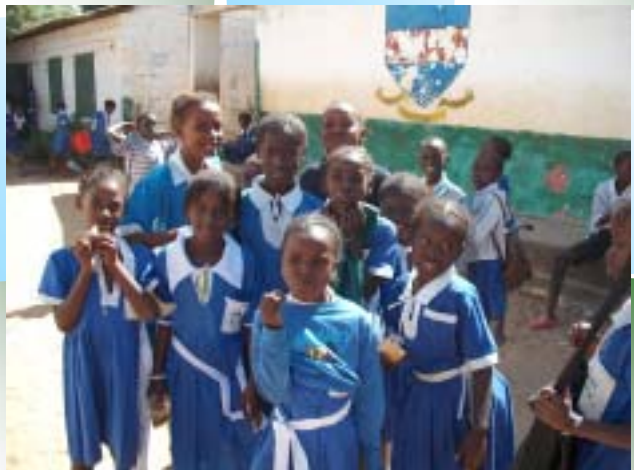
A group of students happy to be back after the holiday