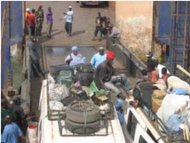
All aboard the ferry for Banjul