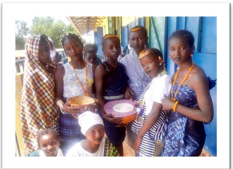
Fula Cultural Group